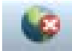
Not Connected to the network