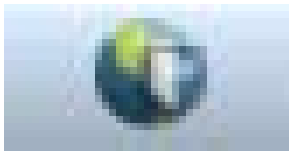
Connected to the network